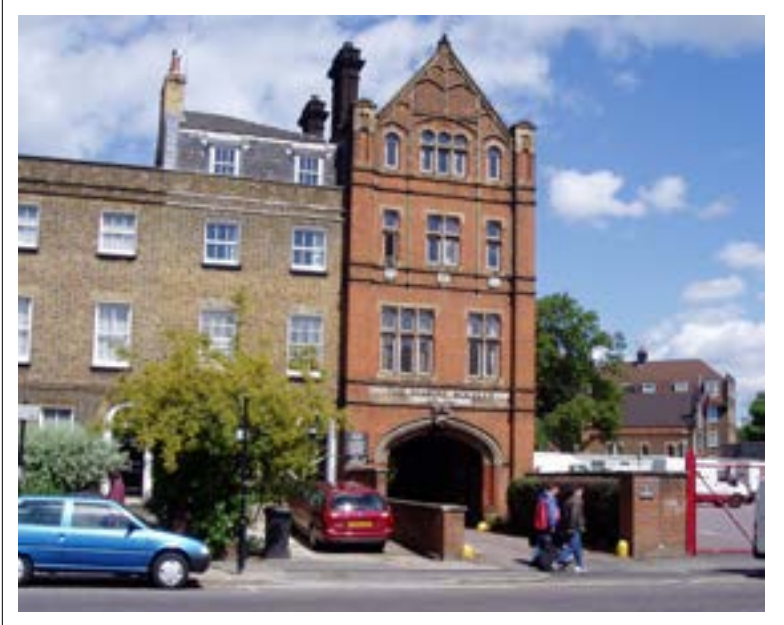
Entrance to IFSMA Office complex at 202 Lambeth Road.

I can recall our last visit to Buenos Aires for an AGA in 2004 and can recommend it as a destination for a break after the AGA with much to see and do.