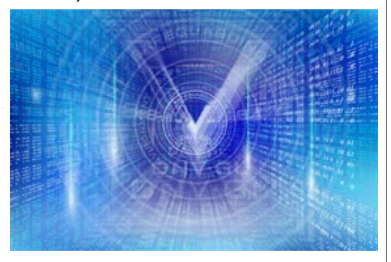
DNV GL has commenced the roll out of IMO compliant electronic class and statutory certificates across its entire fleet.

Certificates are published on DNV GL's customer portal immediately after an onboard survey is completed, so that all relevant parties can access the latest certificates from anywhere in the world. Electronic certificates are secured with a digital signature and a unique tracking number (UTN) which can be checked online, assuring validity and authenticity.