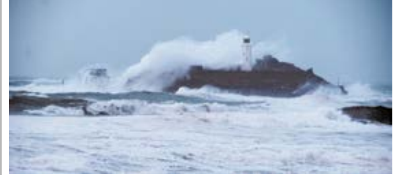
Godrevy in heavy weather. Increase in storm activity could result in aid to navigation casualties.

Trinity House is proud of its success in reducing its carbon footprint and continues to look at innovative ways to continue to make further reductions in our role as an aid to navigation provider. However, even if the objectives of the Paris agreement are met, global warming is a fact that is already resulting in the melting of polar ice and, as it continues, is predicted by many to lead to an increase in extreme weather events and a rise in sea levels of up to 0.5 metre by the end of this century, according to the fifth Assessment Report by the Intergovernmental Panel on Climate Change (IPCC-AR5)